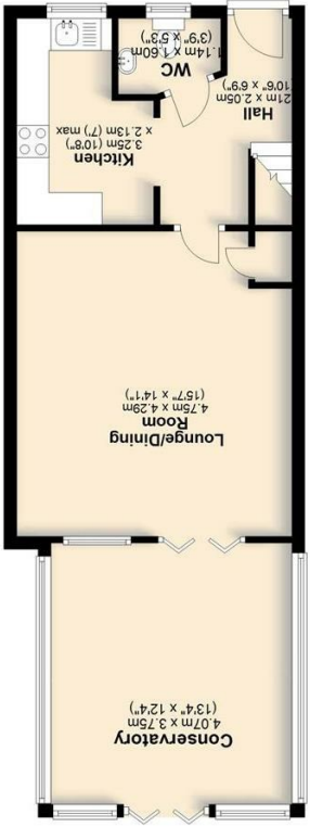
Ground Floor Approx. 50.2 sq. metres (540.6 sq. feet)